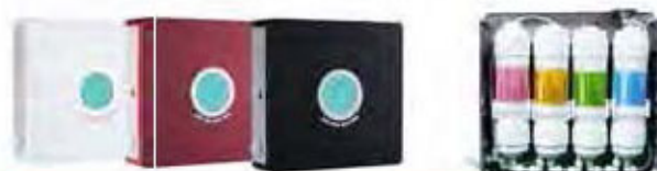
UNDER THE COUNTER

“The low cost filter system means no electricity costs and clean water is available even when the lights are out!” ~Sri Ram Kaa