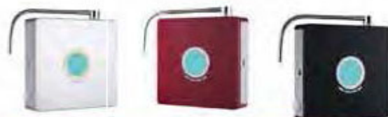
OVER THE COUNTER

The under sink model includes an adapter that screws onto your ½-inch water pipe and you will also receive a separate designer faucet for your counter top.